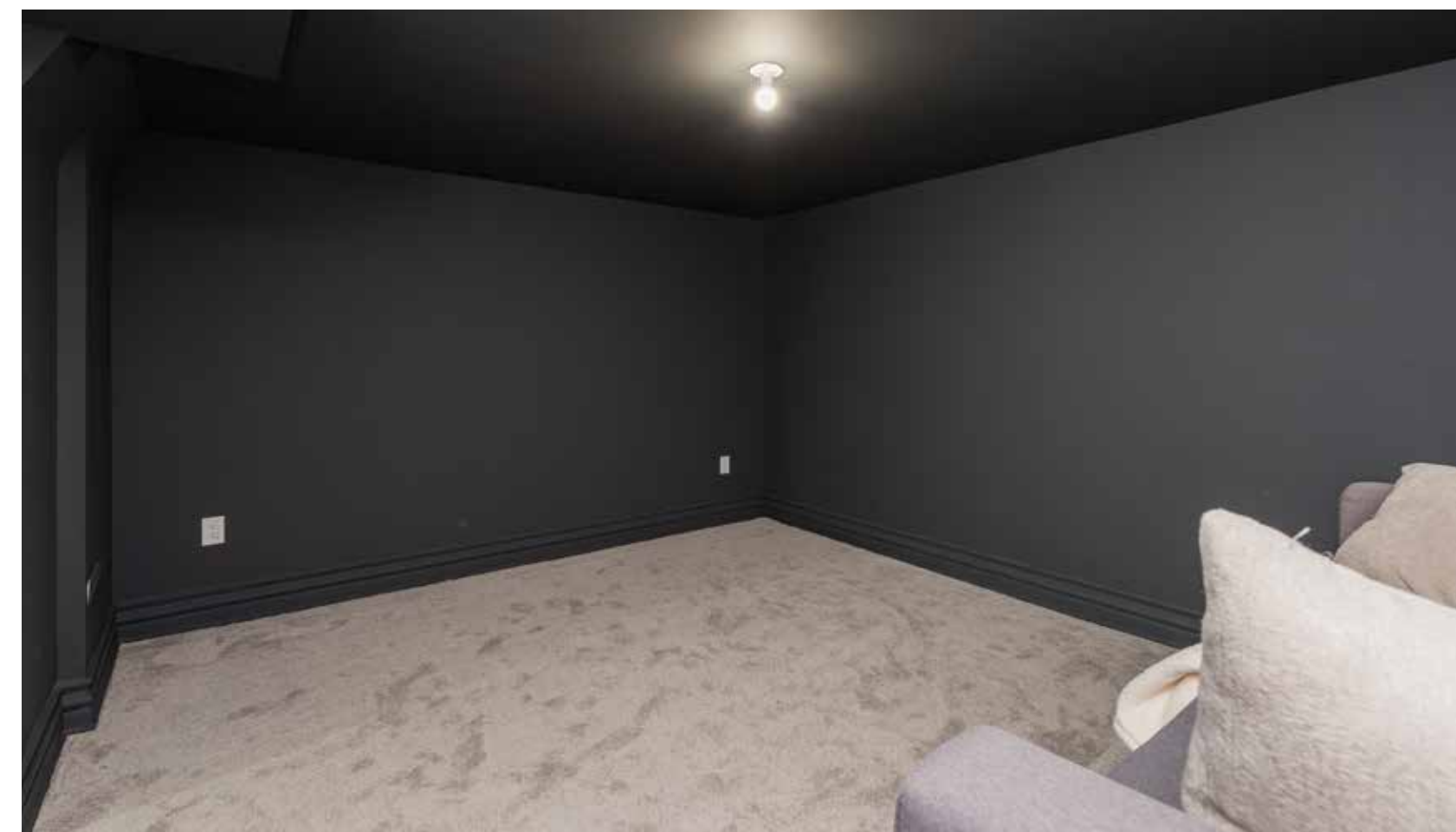
RECREATION & GAMES ROOM