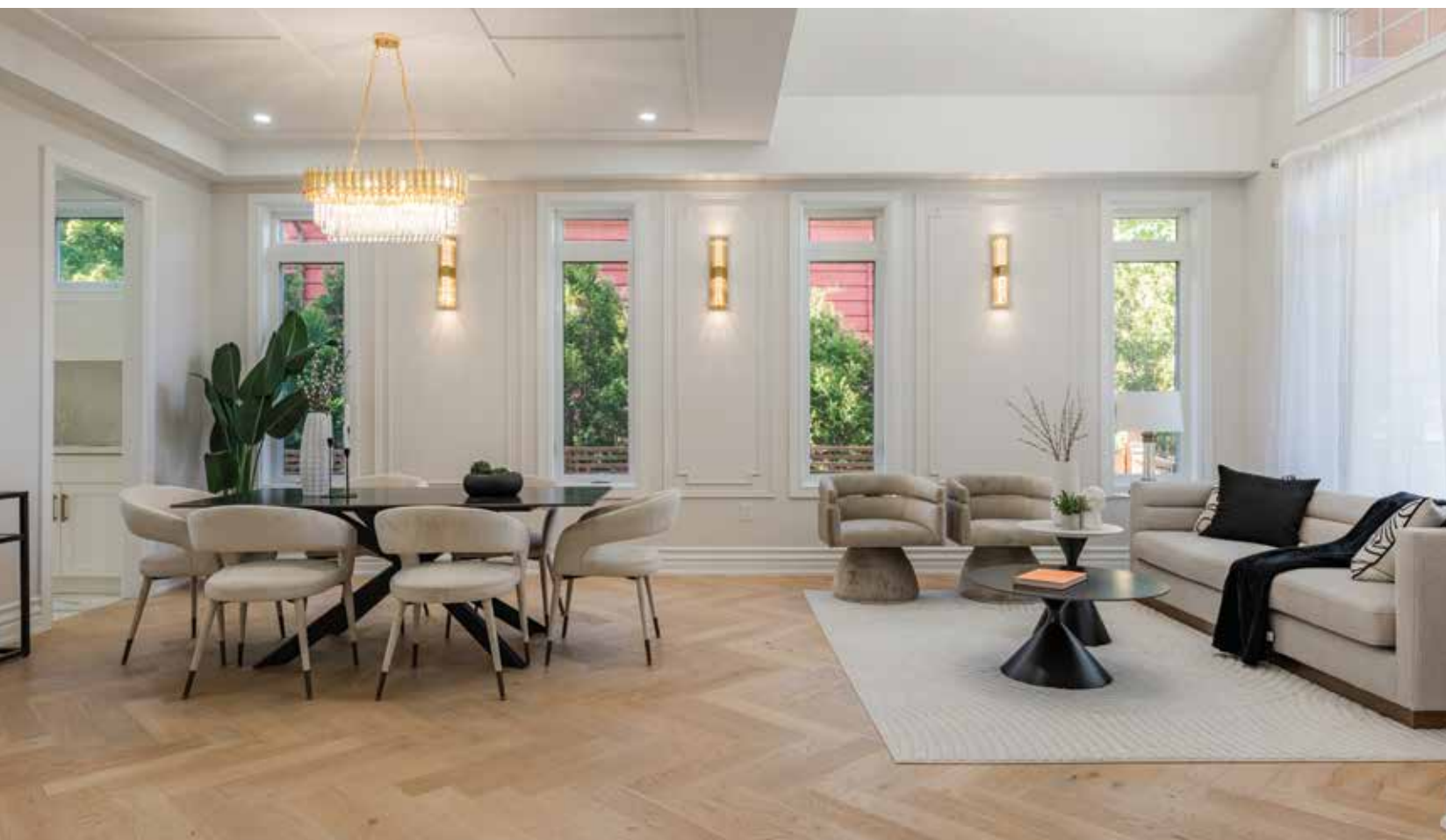
FOYER, LIVING / DINING ROOM