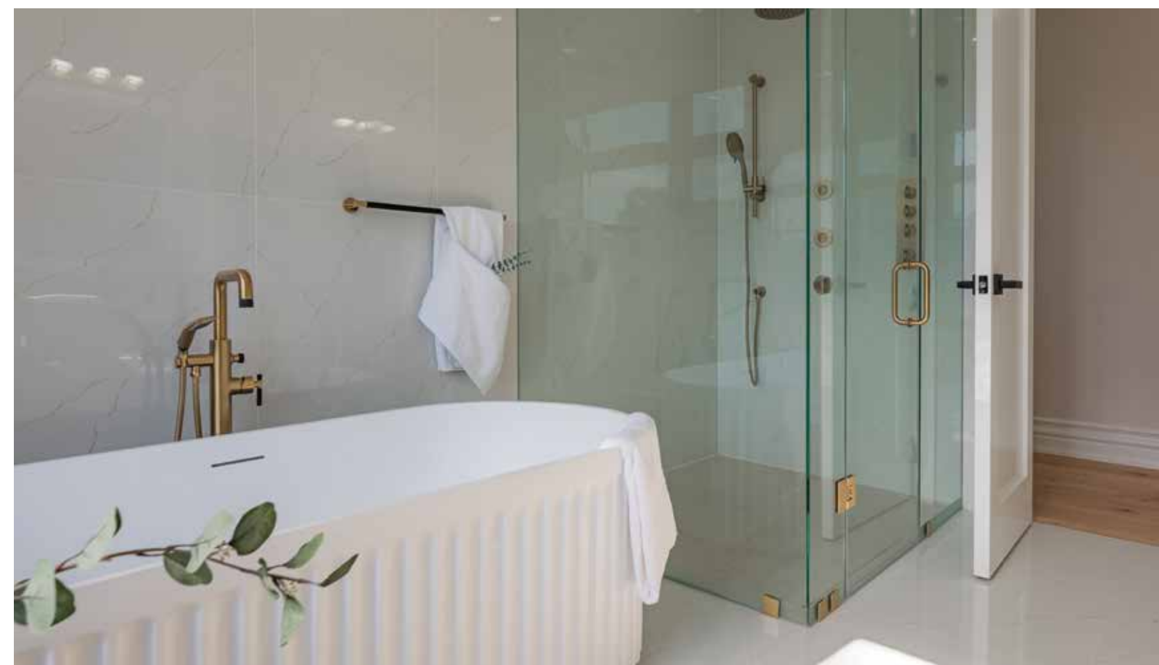
PRIMARY BEDROOM & ENSUITE