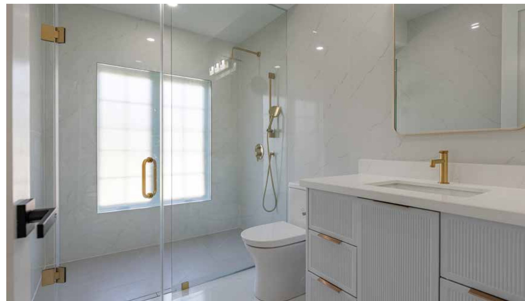
SECOND BEDROOM & ENSUITE