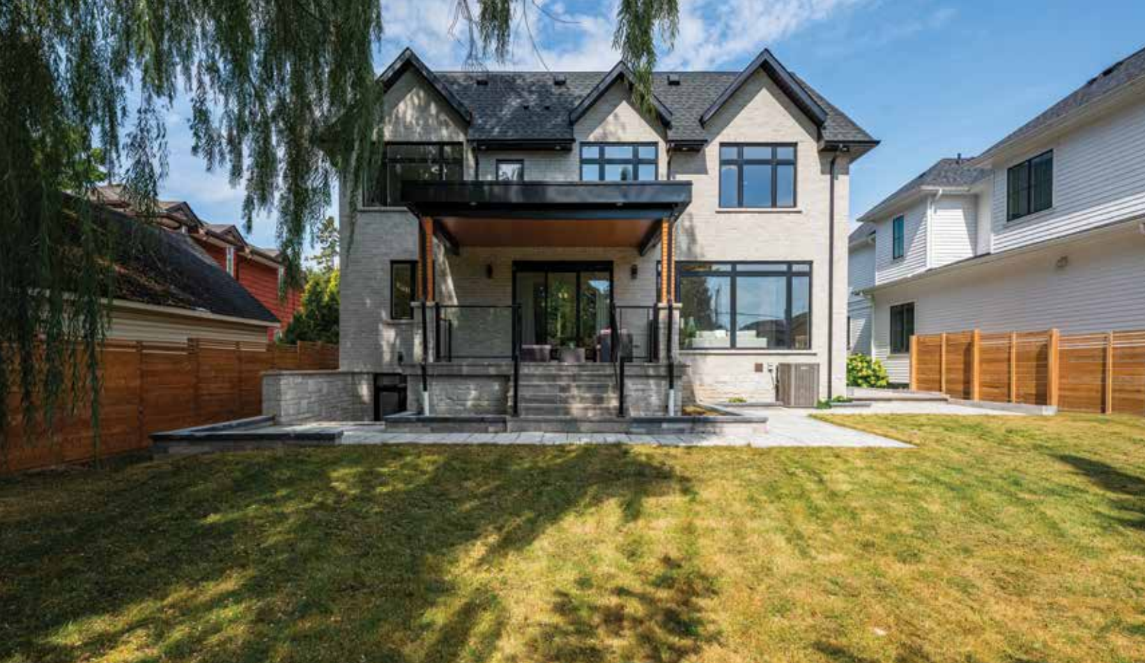
REAR YARD & COVERED PATIO