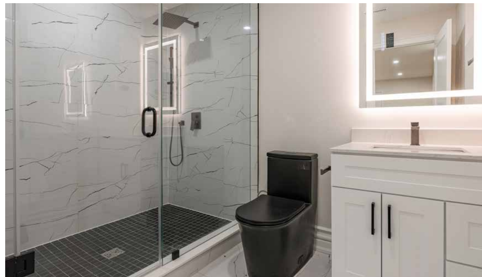
LOWER LEVEL BATHROOM & SAUNA