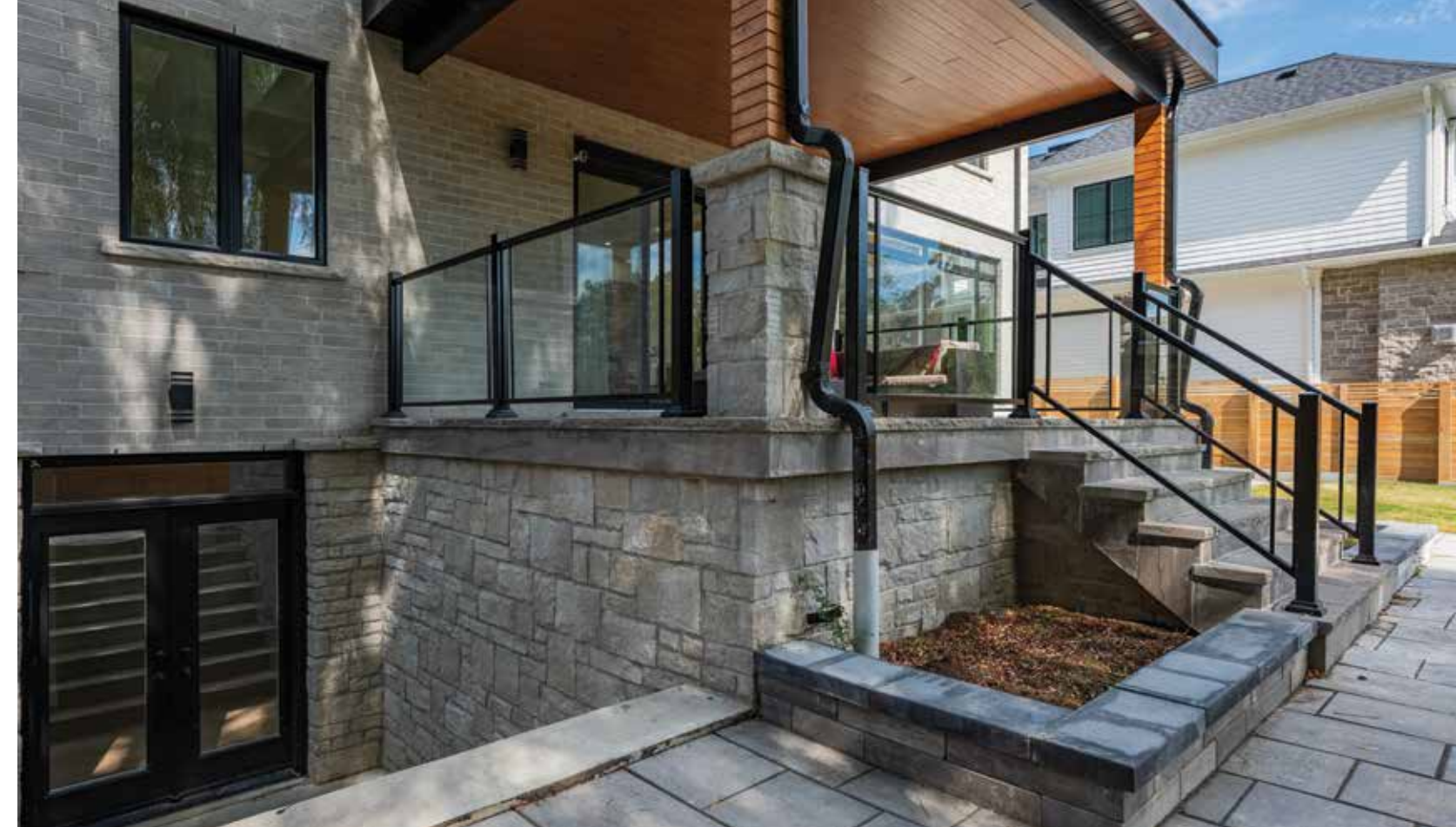
WALK-UP & AERIAL VIEW